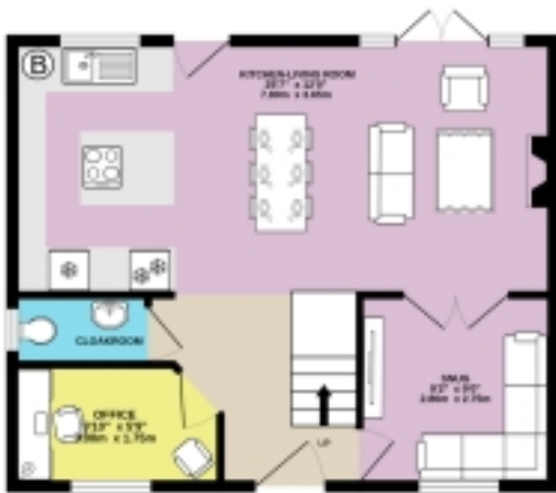
GROUND FLOOR 534 sq.ft. (49.6 sq.m.) approx.